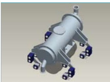
10 Liter Rod Mill for Crushing/Milling Products.