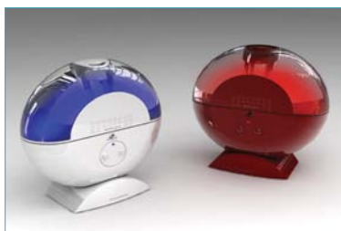
R&D Plus designs innovative products...

Last, but not least, I would like to mention that upon finishing concept design, I usually output the BOM before meeting with our customers. Being able to do this at the push of a button with Pro/ENGINEER allows me to always be well – prepared for my meetings, and to impress our customers with systematic proposals. This is an important aspect for us since it helps us be customer-oriented and thus successful in our business.”